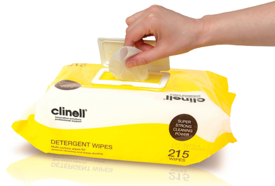
ALWAYS FOLLOW EQUIPMENT MANUFACTURER'S CLEANING PROCEDURES AND GUIDELINES.