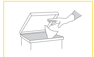
Change wipe if it becomes dry or soiled and discard. Dry the surface with a clean dry paper towel or cloth.